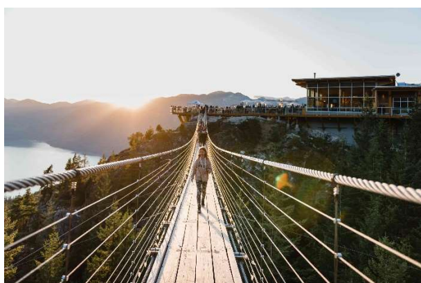
Above left and above right: Sea to Sky Gondola up to summit of Mount Habrich and one of the suspension bridges leading to the nature trails – planned for 20/06/25.