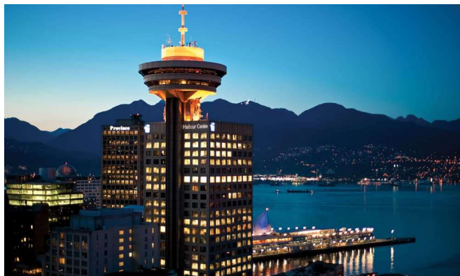
Vancouver Lookout Tower – planned for 16/06/25