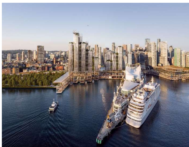
Left: Historic Gastown. Above: Vancouver Waterfront Walking tour including both areas planned for 17/06/25