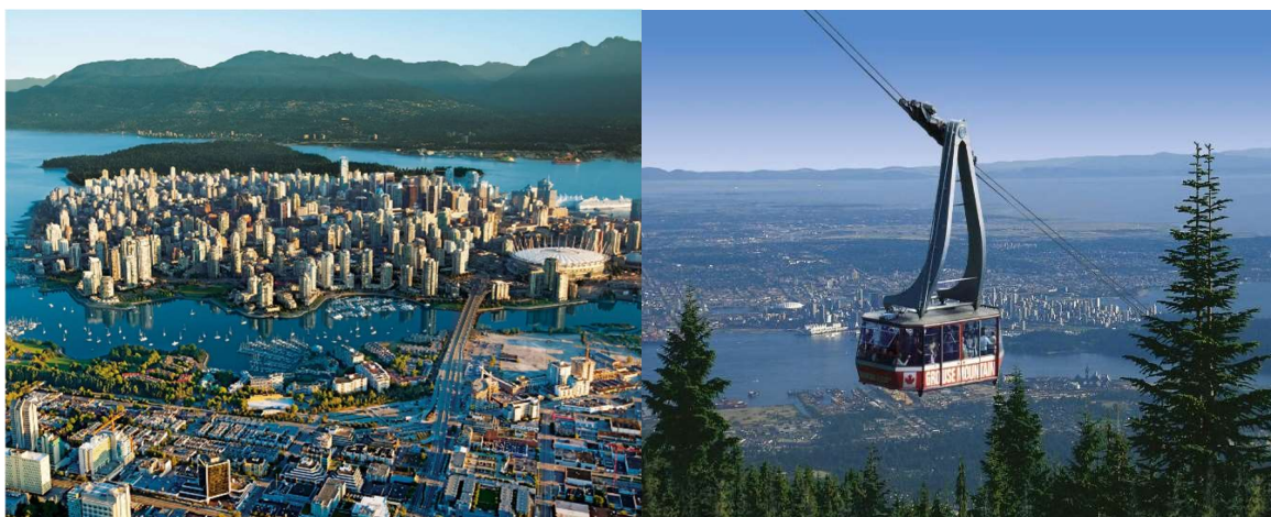
Pictured above left: Vancouver city and bay. Above right: skyride up to Grouse Mountain.

The trip is open for expressions of interest from all pupils in our current S3 – S5 (who will be in S4-S6 at the time of departure).